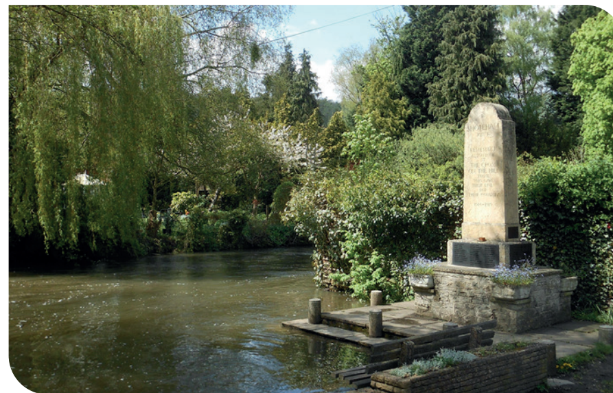
Obscured view from the war memorial