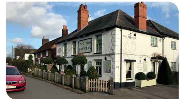
Tall brick chimneys