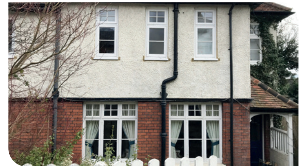
Roughcast and red brick