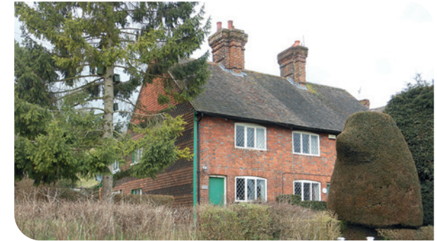
Unbroken roof slopes