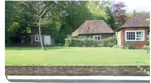
Historic ancillary buildings