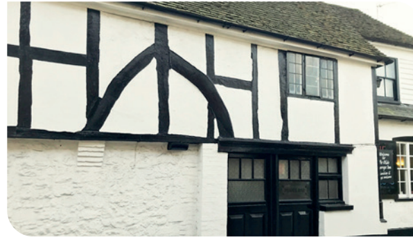
Rubble stone and timber frame