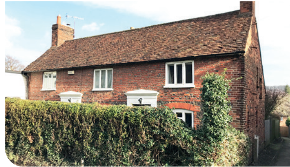
Simple building forms