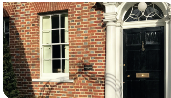
Flemish bond brickwork