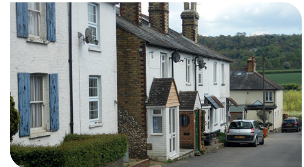
Victorian workers' cottages