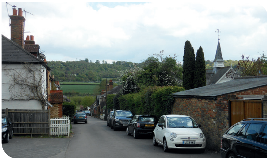
Contextual views which look out to the landscape beyond the conservation area and give an understanding of its topography and rural setting (Views 4–7, 10, 13).

The exception is the view from the war memorial by the bridge up to the war memorial cross on the hill which was consciously designed and is described on the war memorial's inscription. The view is currently obscured by tree growth, even in Winter.