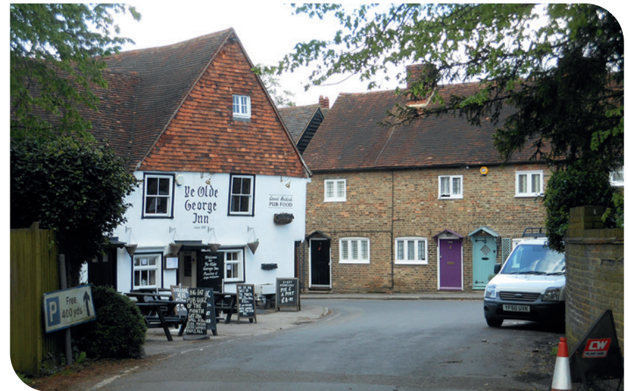
Contrasting areas of looser and denser texture