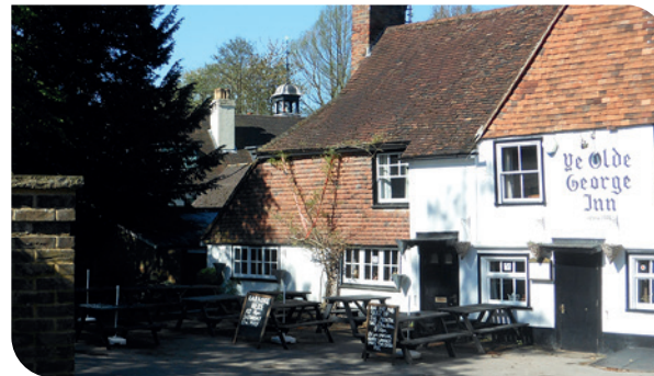
Tile-hanging and clay tile roofs