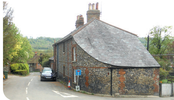
Flint and brick