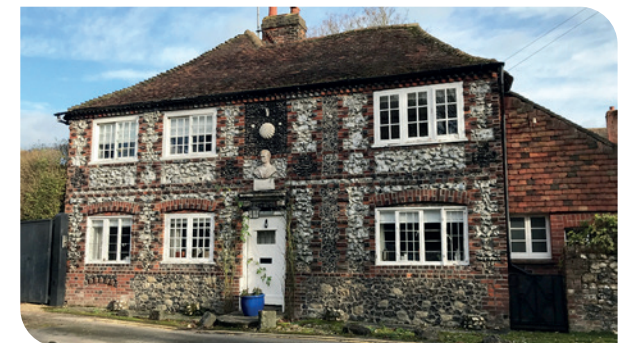
Brick and flint