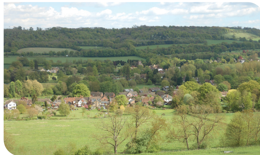
Scenic views from outside the conservation area, which take in the village as a whole, together with its surrounding landscape and help to appreciate its rural setting and well-defined boundary (Views A, B, C and D).