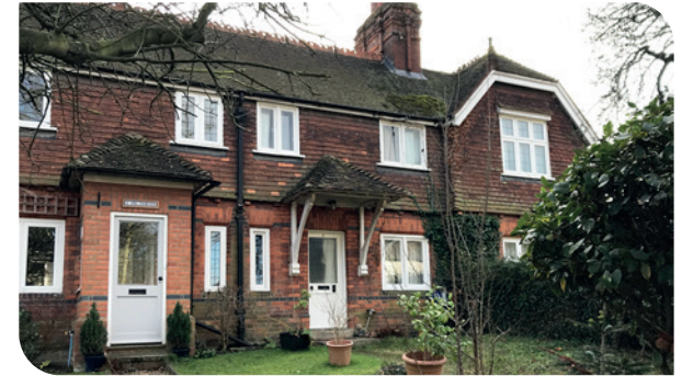
Tile-hanging and red brick