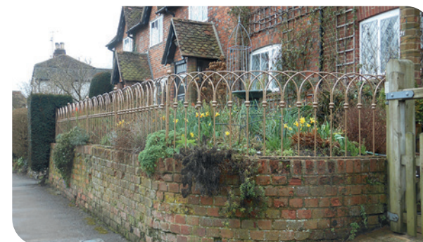
Brick wall and railings