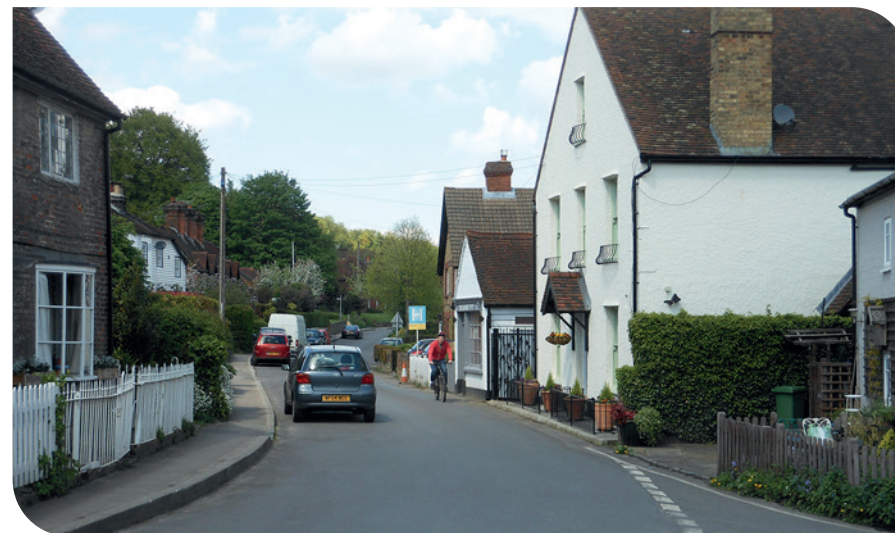
Townscape views within the conservation area which include a mix of building types and materials and give a sense of the spatial character and architectural quality of the village. Trees play an important part in these views, but are sometimes intrusive (Views 1–3, 8, 9, 11, 12, 14–17).