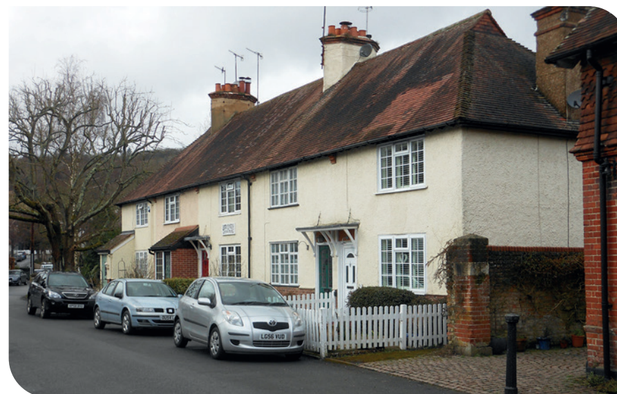
Loss of unity of a terrace of houses due to later additions